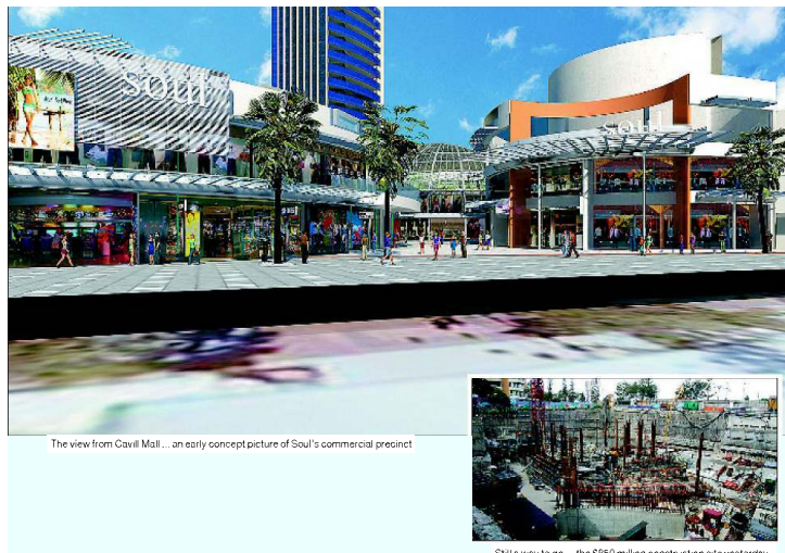
The view from Cavill Mall... an early concept picture of Soul's commercial precinct